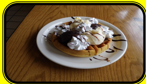
Brownie Waffle A-La-Mode

Substitute your eggs for egg whites or beaters...$1.00